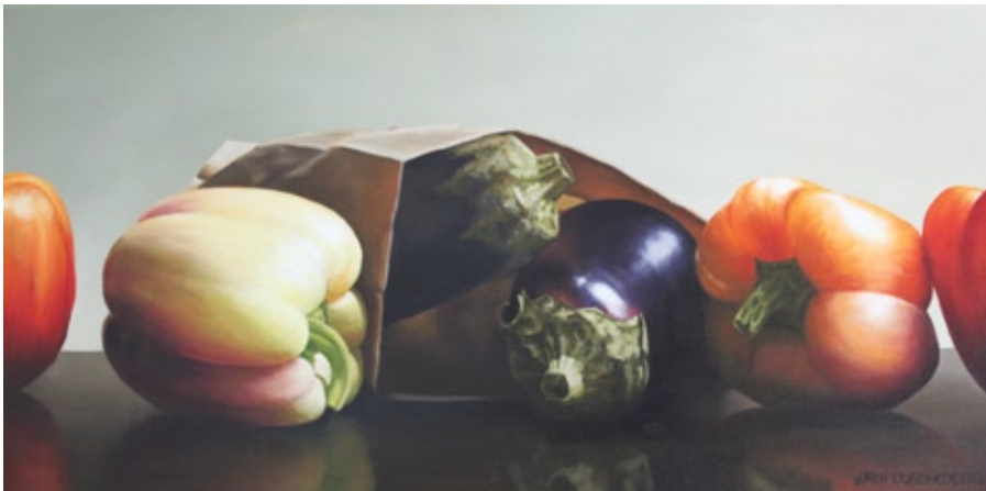
Loren DiBenedetto, Peppers and Eggplants , oil on linen, 12 x 24"