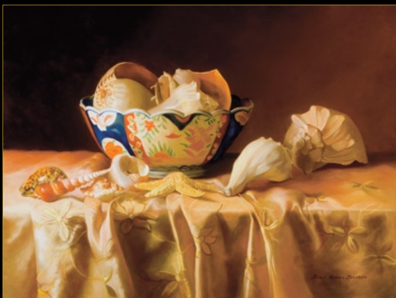
“Shells in a Japanese Bowl” 18 x 24 oil on linen