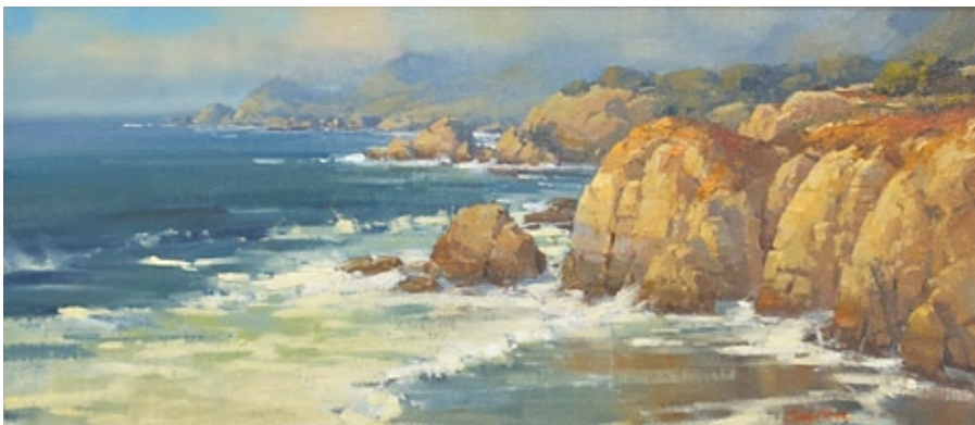
Cindy Baron, Looking North , oil on linen, 9 x 20"

traveled south from San Francisco, backpack in trunk and many stops later I landed in Big Sur to paint. Being an artist you are always taking in the atmosphere, memorizing colors and values, knowing that major work is done in studio from memory and studies.