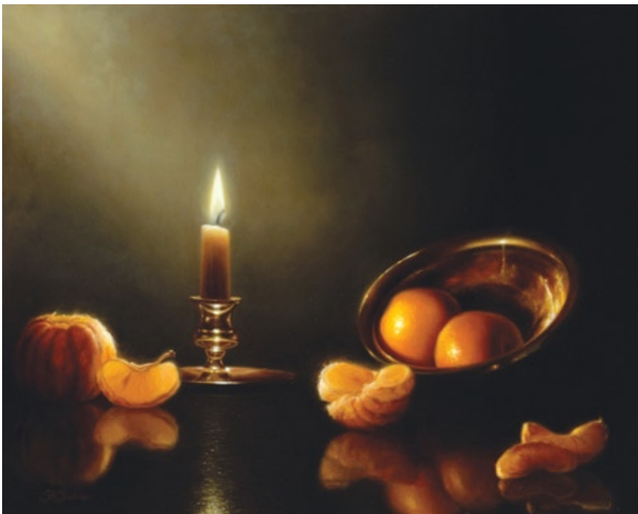
Suzanne Hughes Sullivan, Twilight Illumination , oil on wood, 16 x 20"