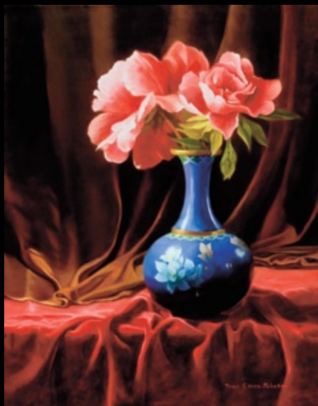
“Peonies in Blue Vase” 20 x 16 oil on linen