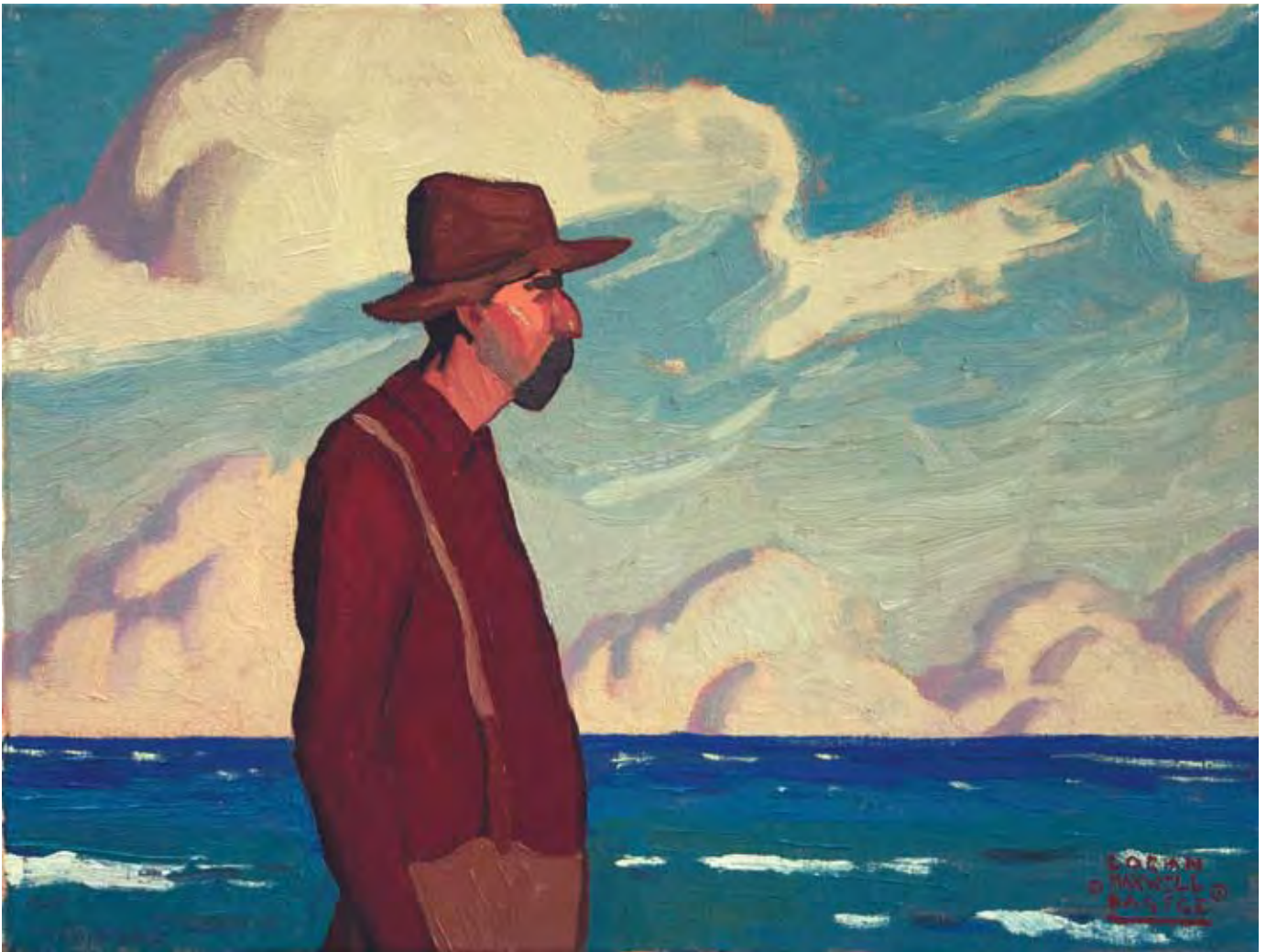
CLOUDS OVER THE SEA, OIL, 12 X 16"