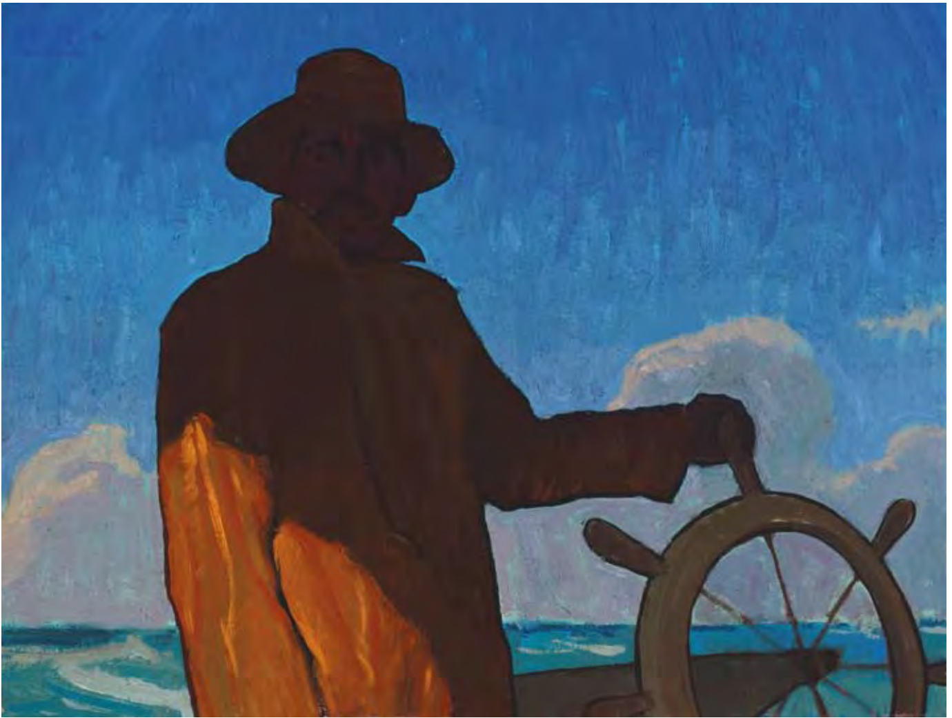
CLEARING STORM, OIL, 18 X 24"

me to the next. I hope this honest vision comes through in my work."