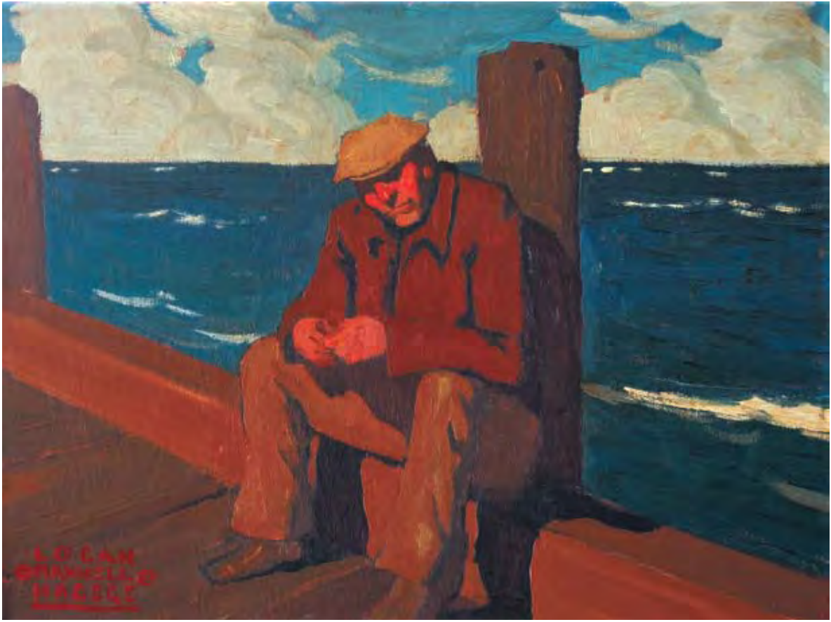
LOOKING FOR WORK AT THE DOCK, OIL, 12 X 16"