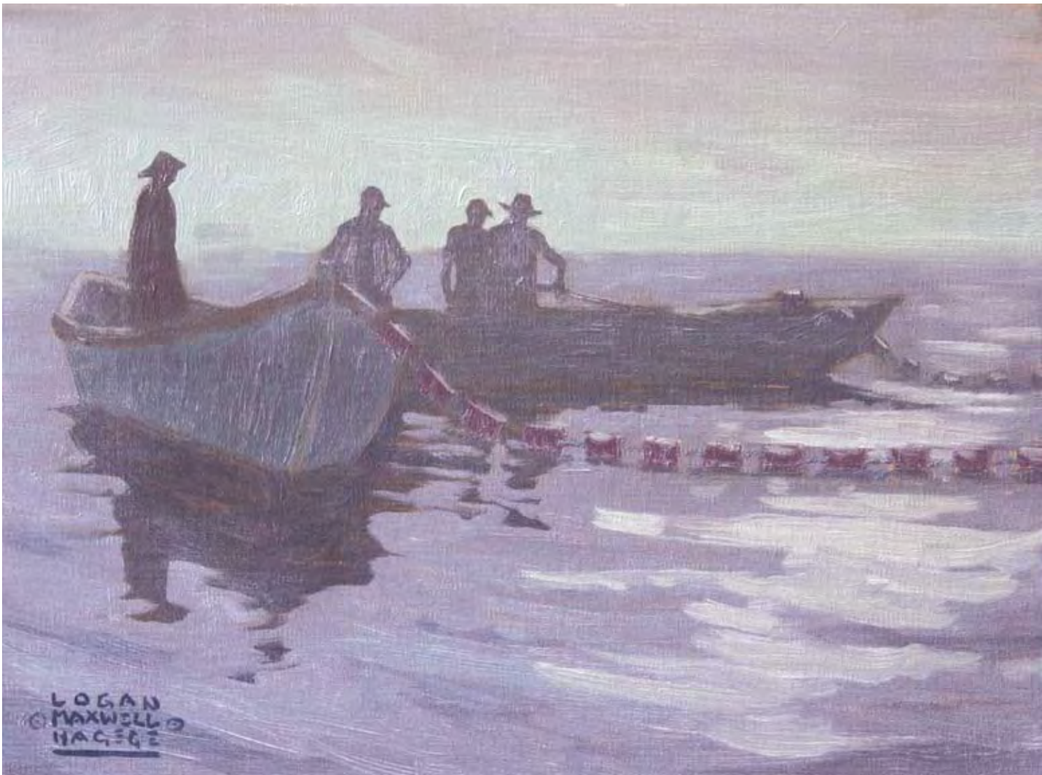
FISHING IN THE FOG, OIL, 12 X 16"

Known for his Southwest imagery, mostly of Native Americans and Southwest landscapes, this new grouping allows Hagege to flex his artistic muscles and focus on the Eastern Seaboard. Much of the series is based on Cape Cod fishermen. He begins by building a composition referenced from historic photos and