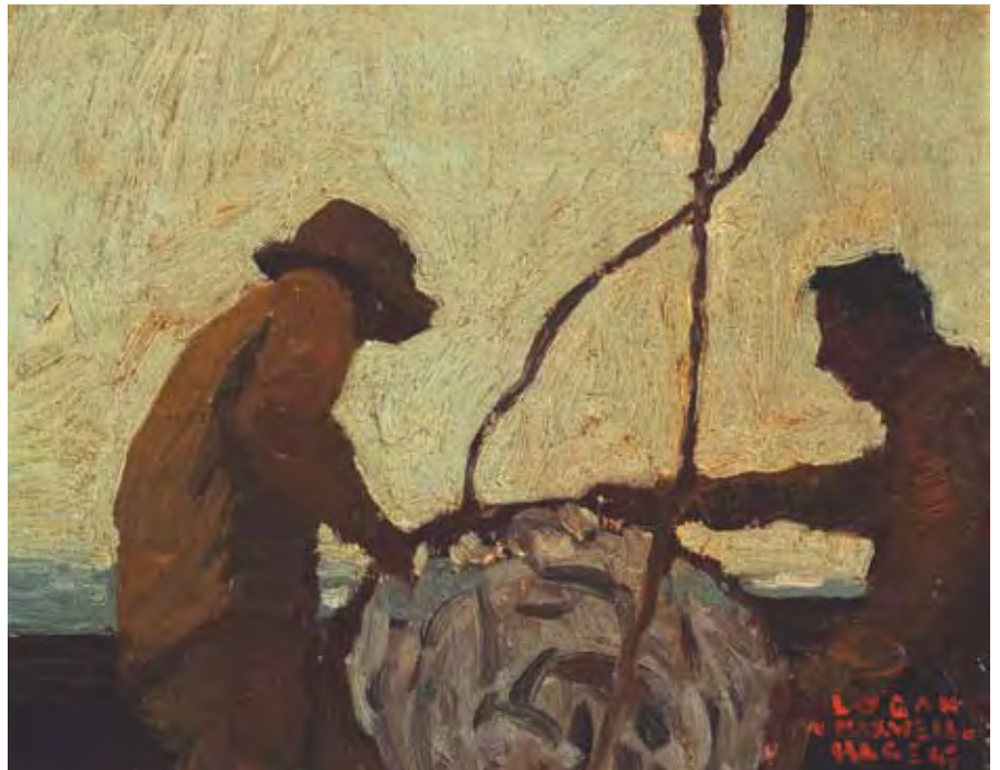
HAULING AND BURNING, OIL, 8 X 10"

"A lot of people mistake them for historic work. When I think of paintings from a different era, I think of high quality," says Hagege. "I do not consider myself an impressionist or an expressionist. I paint what strikes me at that very moment and one painting leads