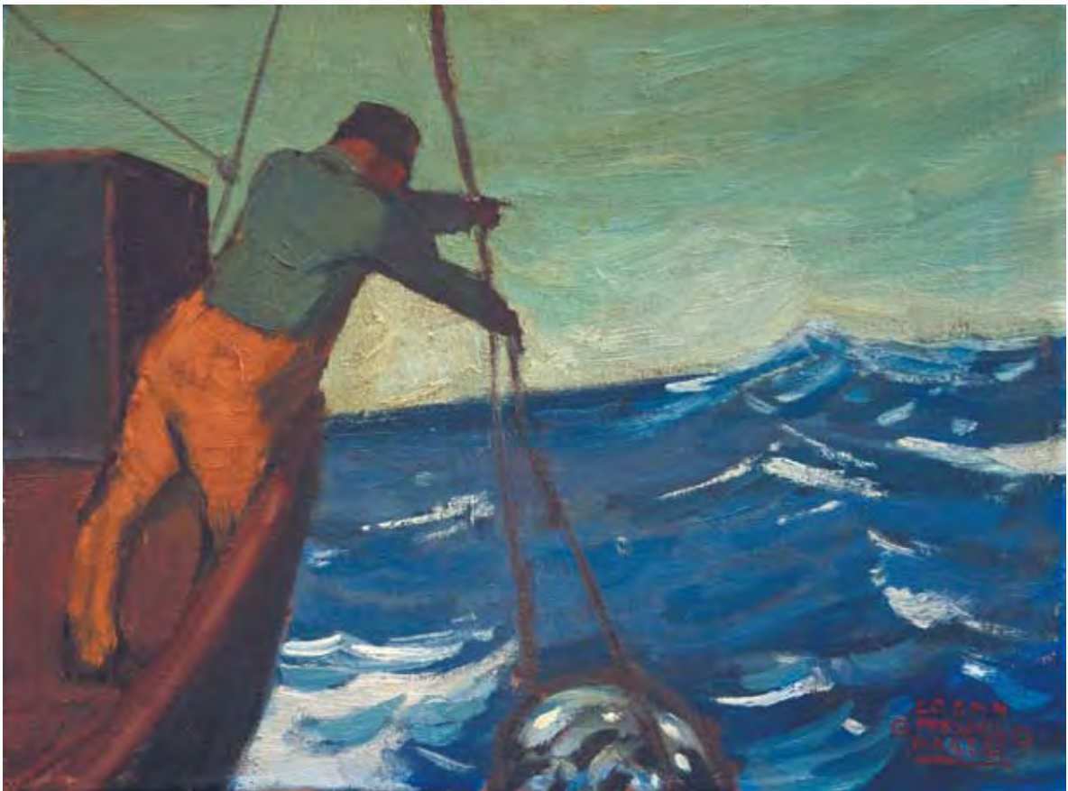
THE DIP NET, OIL, 12 X 16"