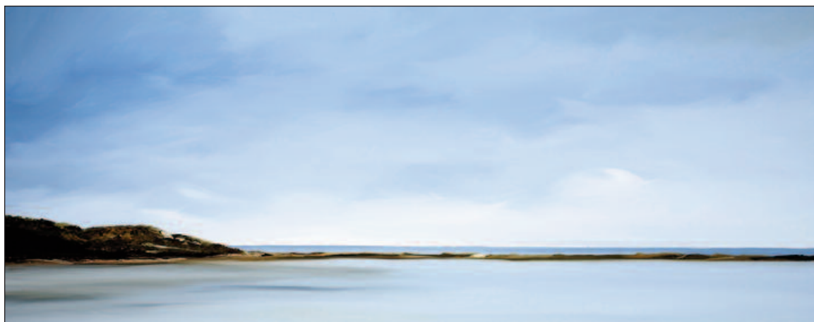
Great Island oil on canvas Rick Fleury 20 x 50 x 1.5 $5,200