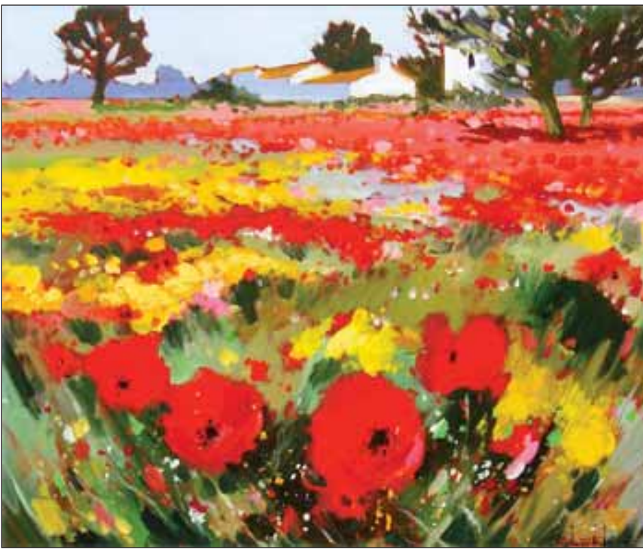
Shown: Poppies 23.5 x 28.75 $7,600