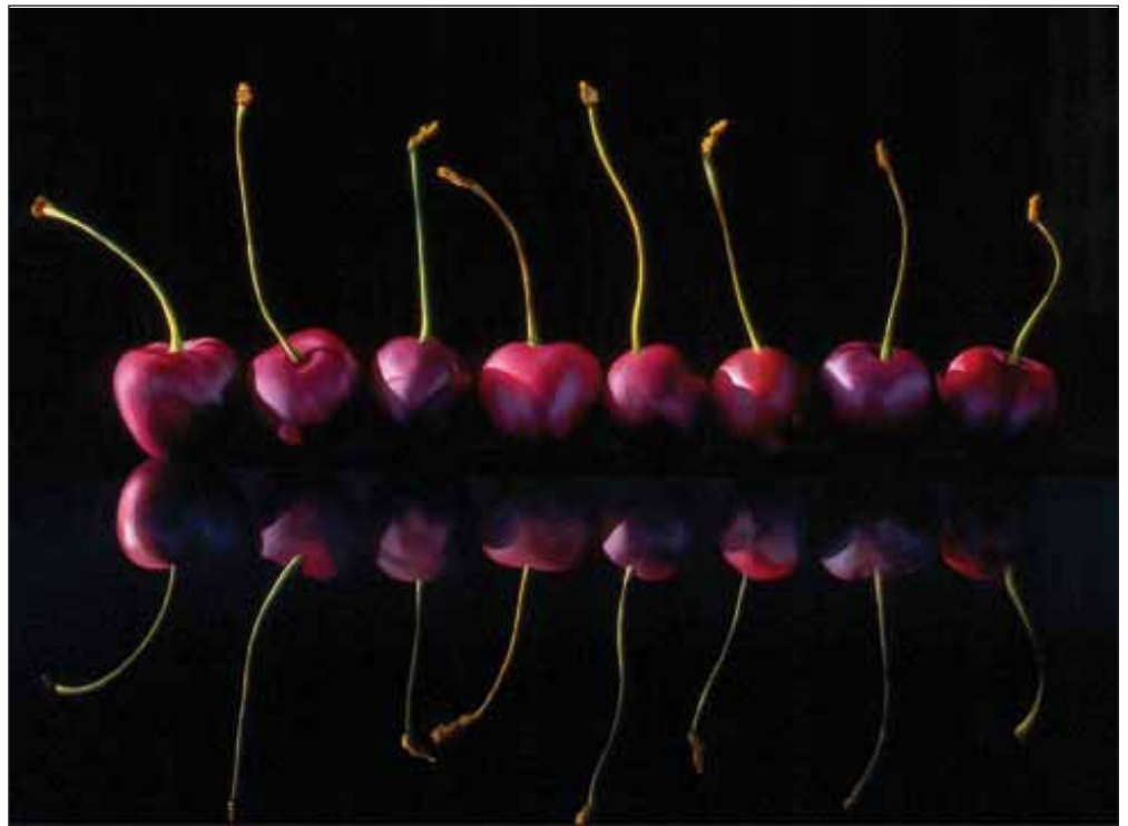
Bing Cherries oil by Laura Griffith 36 x 48 $6,400

A special Cream Tea Friday, August 10 from 2 to 4 (please RSVP).