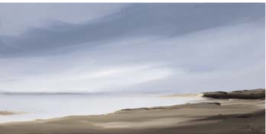
Passion oil on canvas Rick Fleury 10 x 20 x 1.5 $950