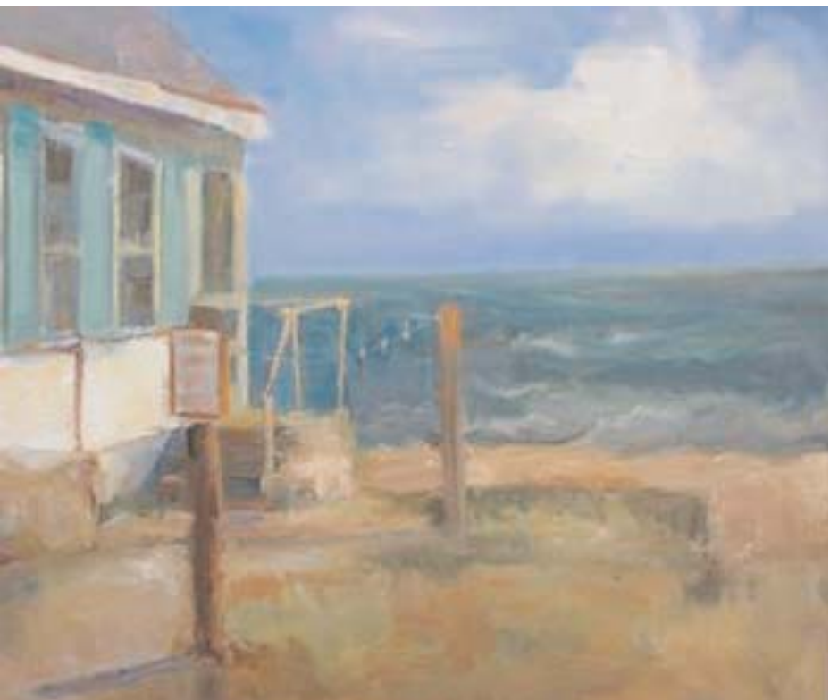
Brisk and Bright oil/mixed media Joan Brancale 6 x 16 $1,200