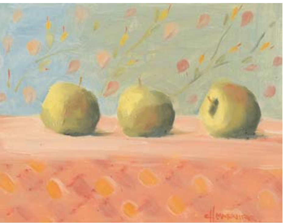
Three Apples oil on panel Carol McGuire 8 x 10, framed 14 x 16 $750