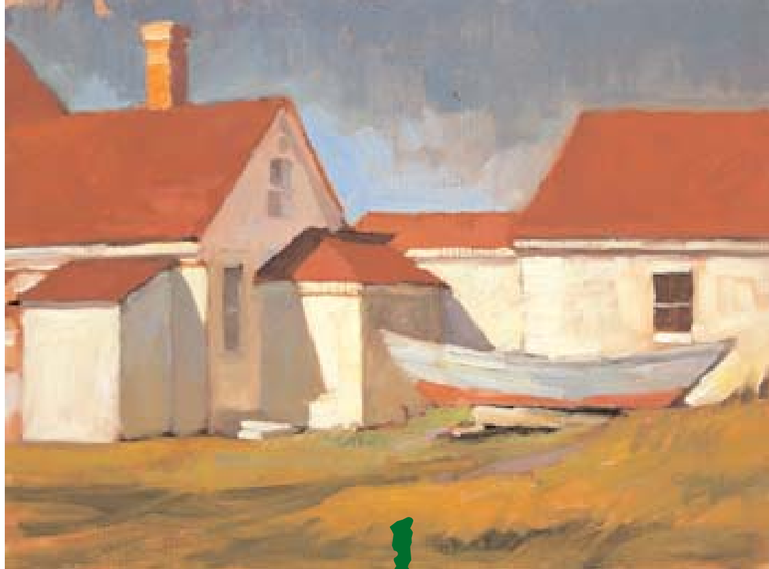
By the Lighthouse, Monhegan oil