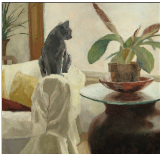
Contemplating Freedom oil Maryalice Eizenberg 24 x 24, framed 32 x 32 $2,200

Questions are most welcome, providing a wonderful opportunity to develop a deeper understanding of the creative processes behind the work one collects.