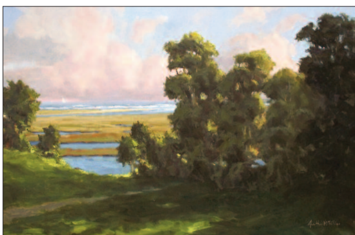
Fort Hill Overlooking the National Seashore oil on linen Jonathan McPhillips 24 x 36, framed 34 x 46 $5,200

Quieter times allow one's inner inspiration to come to fruition, often in ways distinctly different from other truly creative works. Please join us for this exhibition of exceptional new works by gallery and invited artists and the continuing Courting the Figure show.