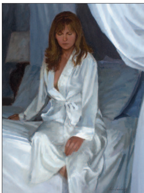
White Satin and White Linens oil on panel Paul Schulenburg 24 x 18, framed 30 x 24 $3,300