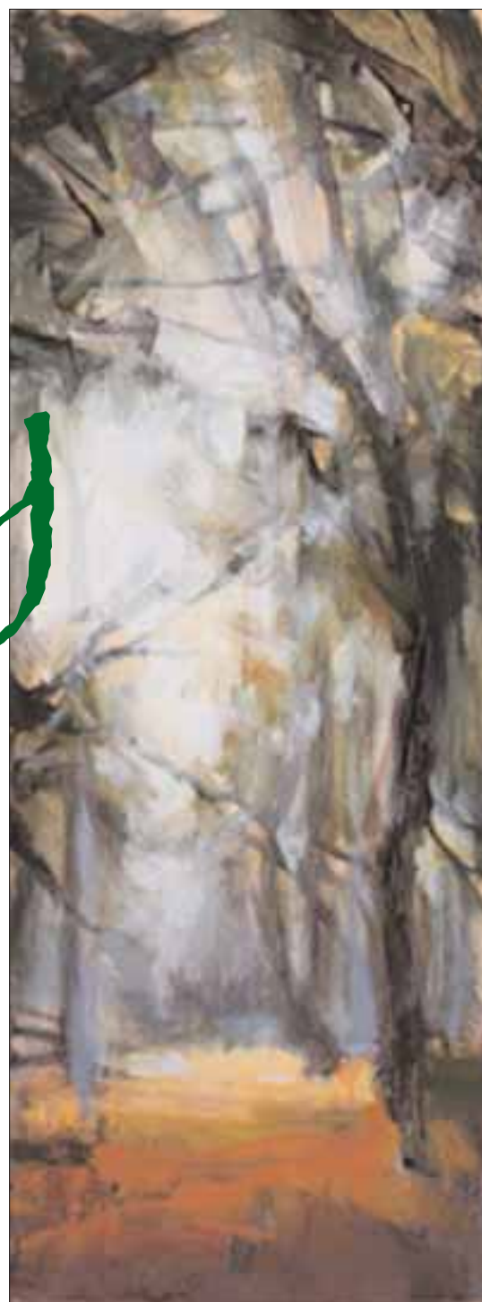
Quietude oil Mary Moquin 15 x 6 $950