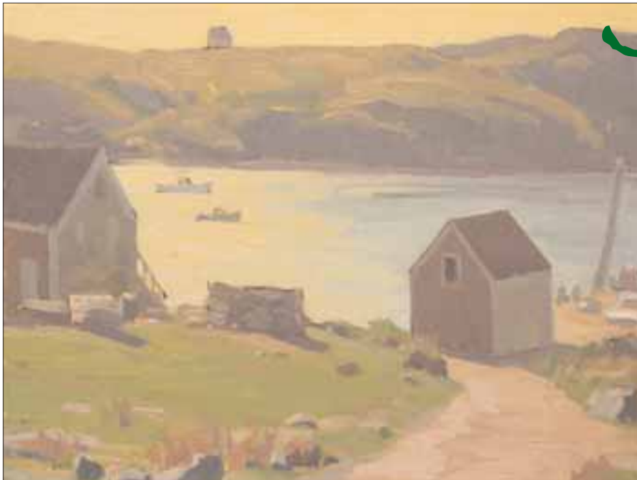
Afternoon on Monhegan oil Glenn Dean 20 x 24 $4,800