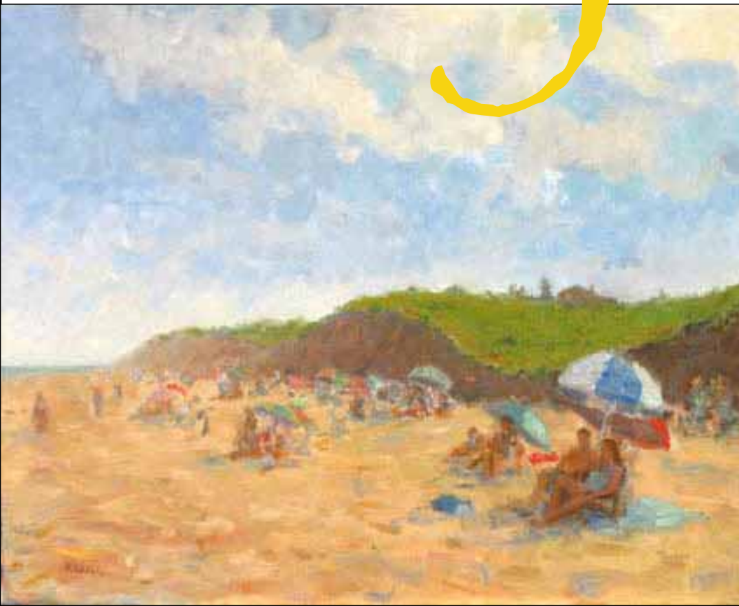
Afternoon at Nauset Light oil on linen Peter Kalill 16 x 20 $1,600