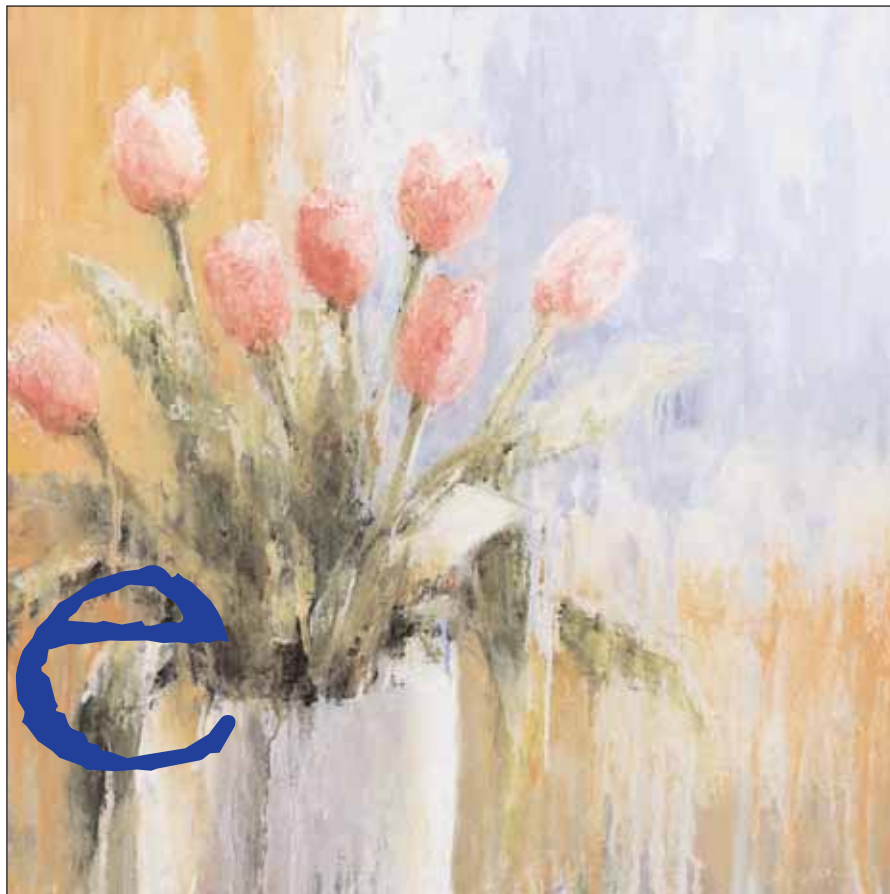
Pink Tulips oil Pharr Schulenburg 24 x 24 $2,750