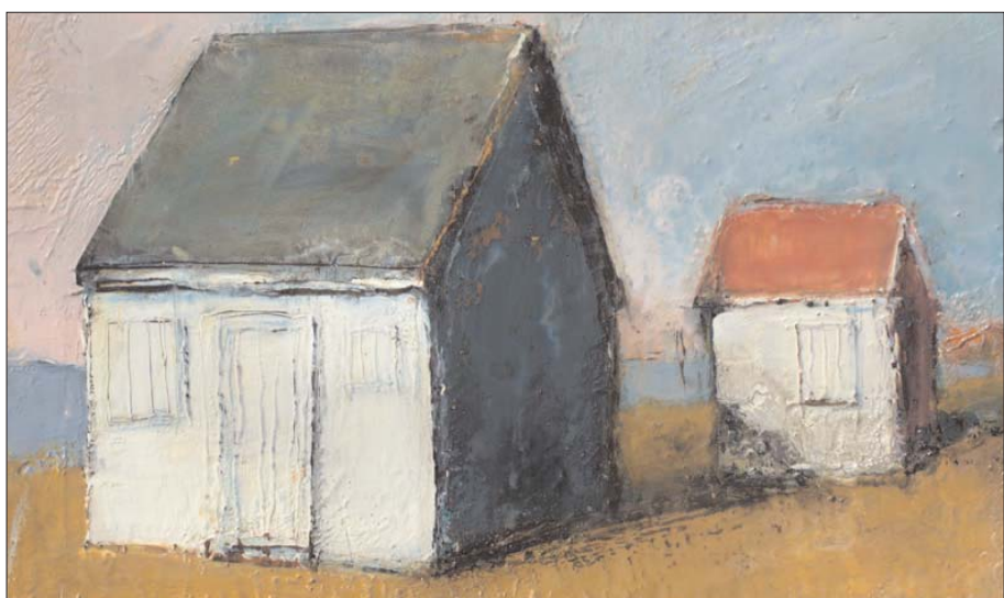
Big Shack, Little Shack encaustic, mixed media Marc Kundmann 14 x 15 $1,975 Watch Marc paint at addisonart.com .