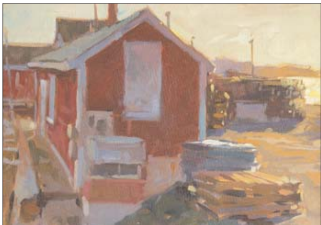
Pieces of Light oil on canvas Colin Page 12 x 16, framed 13.75 x 17.75 $950

"I love the drama that comes from light glancing across the water. The top right section of this painting feels like it glows, and that sets the tone for the rest of this piece." Colin Page