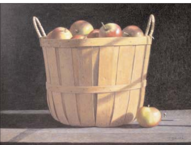
Bushel of McIntosh giclée Garry Gilmartin 10.5 x 14 $250 (framed 19 x 22 $500)

Photos of the reception held at the gallery can be seen at At the Gallery .