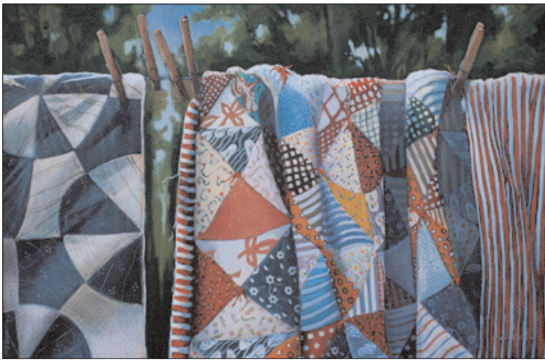
Well Loved, Revisited acrylic Odin Smith 23 x 35, framed 29 x 41 $2,500