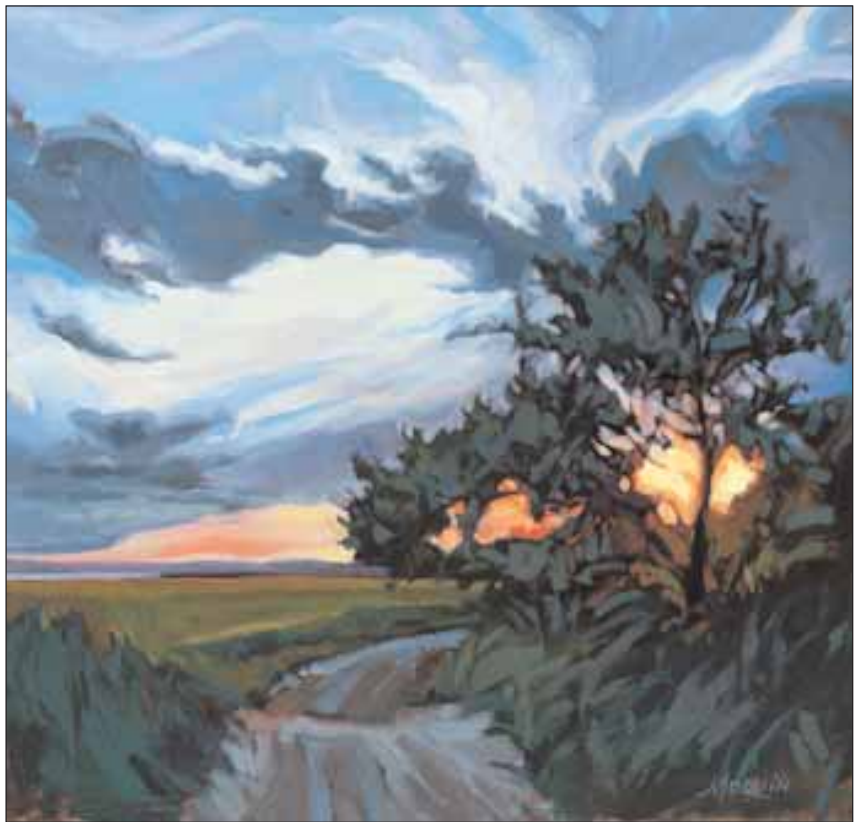
As Light Departs oil Mary Moquin 25 x 27, framed 30 x 32 $2,200