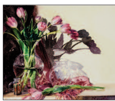
Shown Above: Tulips and Pink Shawl watercolor Vera Champlin 8 x 10, framed 15 x 17 $700

Vera will demonstrate watercolor next door at 45 Route 28, Friday and Saturday, May 7 and 8 from 2 to 4:30. Other Beth Bishop weekend activities include a wine tasting with Main Street Gourmet and complimentary makeup hints by Sue MacLoud of Heaven Scent You. For more information, please visit bethbishop.net .