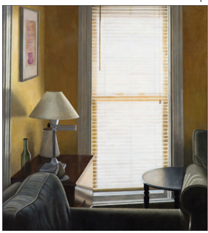
Intuition oil on panel Nick Patten 40 x 36, framed 41.5 x 37.5 $10,500

Saturday, May 8 from 2:00 to 3:00 Floral demonstration by Sonny Gada