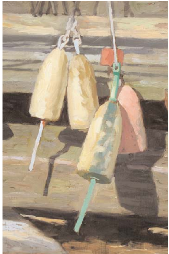
Buoys Tied to the Deck oil on panel Paul Schulenburg 12 x 9, framed 18 x 15 $1,200

“Be like the flower, turn your face to the sun.” Kahil Gibran