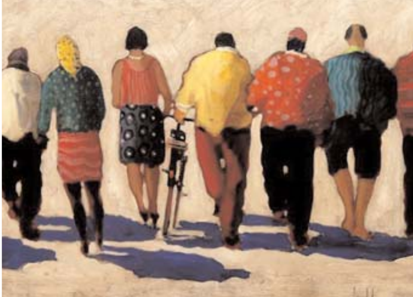
Les Saltimbanques (The Circus Gang) oil and acrylic Olivier Suire Verley 23 x 29 $7,100

American Art Collector has called Addison Art "one of the most successful galleries in the country" for astounding "the public with art by newly discovered artists and masterpieces by established artists."