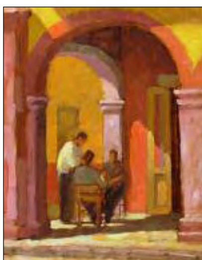
Café Study oil on panel Paul Schulenburg 12 x 9, framed 18 x 15 $1,200

Please click on our events page for holiday activities and the events we've already scheduled for 2010.