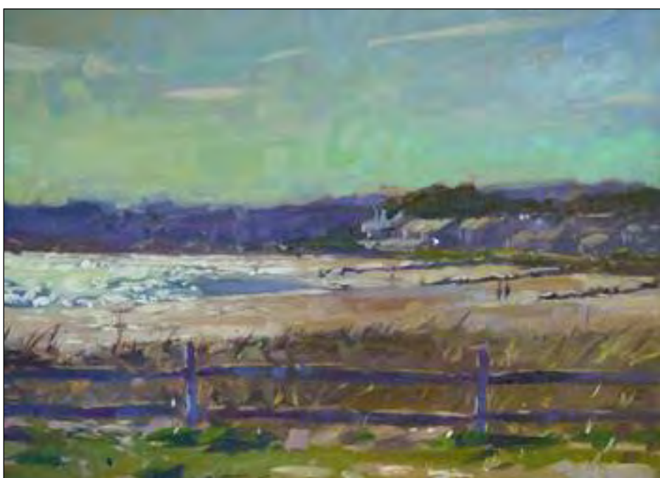
Wellfleet Beach oil on canvas Colin Page 12 x 16, framed 14 x 18 $950

Colin has impressive talent (I've been awed by the established artists who have come into the gallery just to study his work), joyful energy and a most admirable dedication to creating works of beauty.