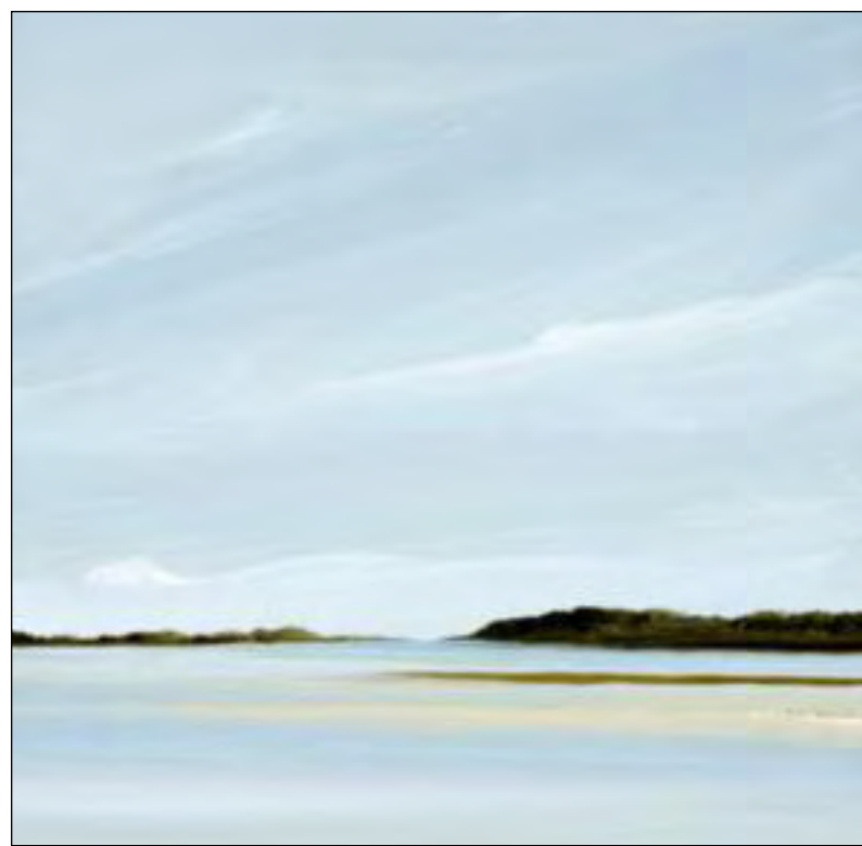
Margin oil on canvas Rick Fleury 12 x 12 x 1.5 $850

Join us at New England's premier exhibition of contemporary and traditional art at The Cyclorama, 539 Tremont Street in the South End. The weekend will include 40 established galleries, panels led by national art experts, lectures and a book signing.