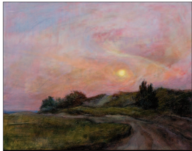
Almost There Mary Moquin encaustic, oil, oil crayon on panel 16 x 20 $1,500

Moquin uses a mixed media approach often incorporating the use of hot or cold wax. She holds a BFA in printmaking and an MFA in painting and teaches painting at the Cape Cod Art Association in Barnstable.