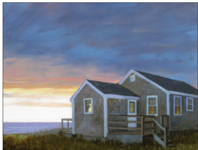
Sunset Cottage Paul Schulenburg oil on panel 11 x 14 $1,600

Wishing you and yours a wonderful Thanksgiving from all of us at the Addison Art Gallery