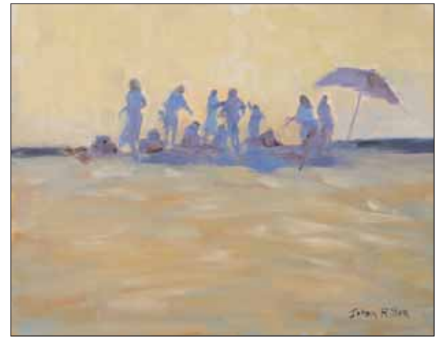
We're Having a Party oil Jo Ann Ritter 11 x 14, framed 17 x 19.5 $1,000. http://addisonart.com/ritter_ja.html