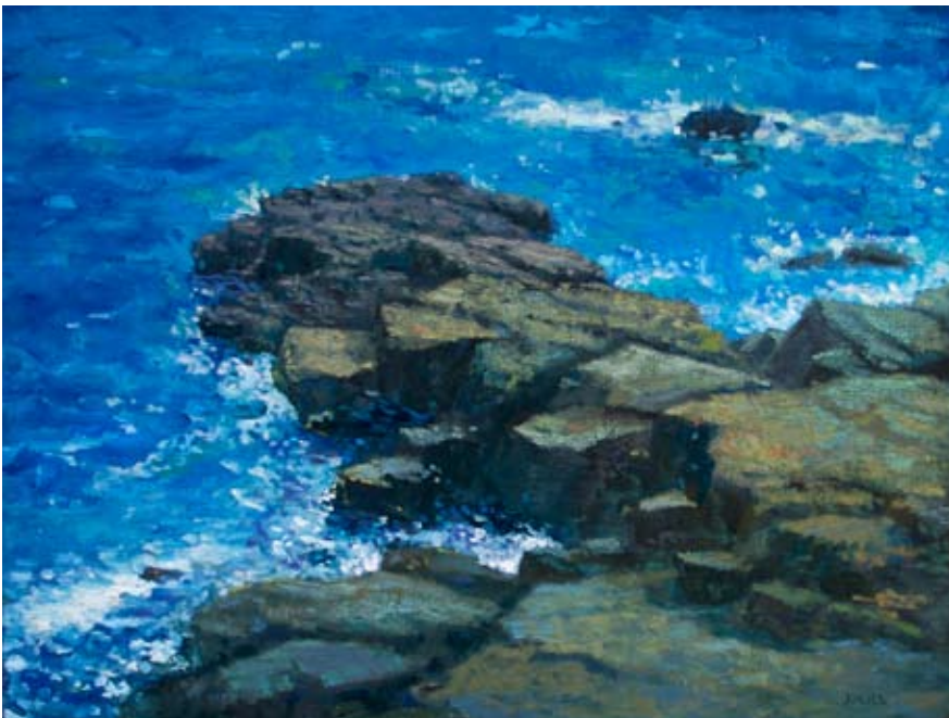
PETER KALILL, ROCKY SHORE, OIL ON CANVAS, 16 X 20"