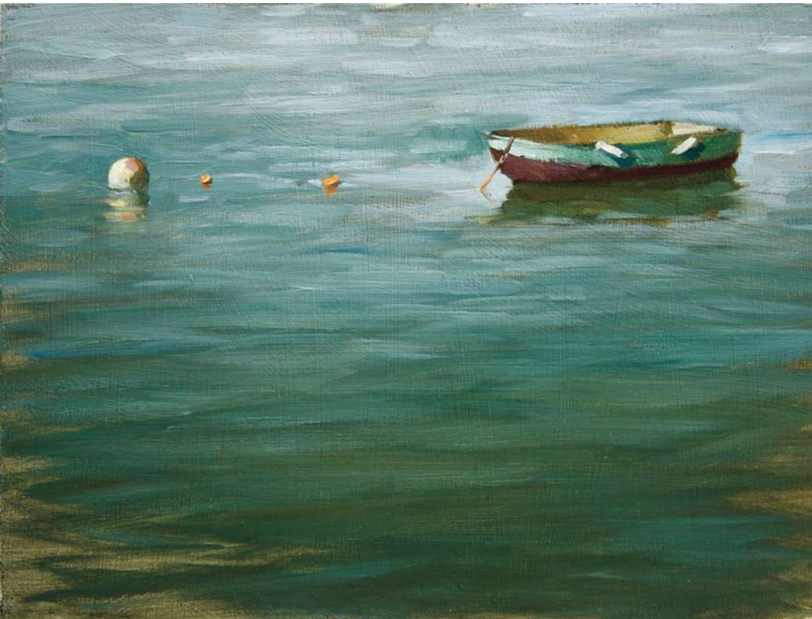
PAUL SCHULENBURG, BAILEY'S MOORING, OIL ON PANEL, 9 X 12"