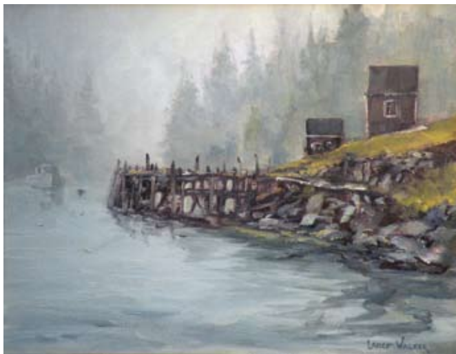
LANCE WALKER, FOGGY MORNING, OIL ON CANVAS 11 X 14"