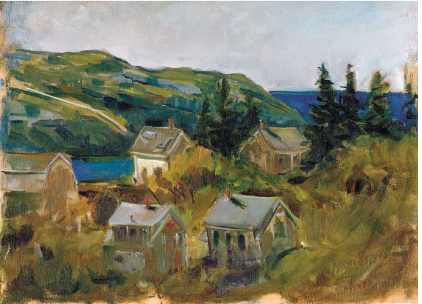
JEROME GREENE, MONHEGAN COTTAGES, GOAT ISLAND, OIL ON CANVAS, 9 X 12"