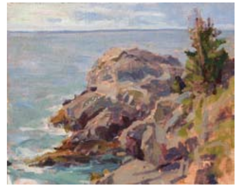
FRANK GARDNER, GULL ROCK, OIL ON CANVAS, 8 X 10"