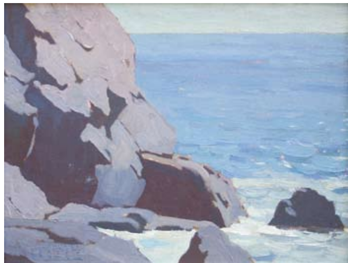
LOGAN HAGEGE, WHITE HEAD, MONHEGAN, OIL ON CANVAS, 12 X 16"