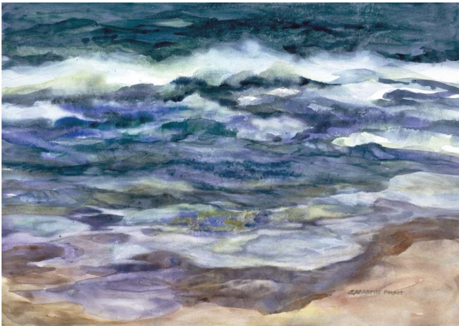
BREAKING ON THE BAR, WATERCOLOR, 15 X 23"