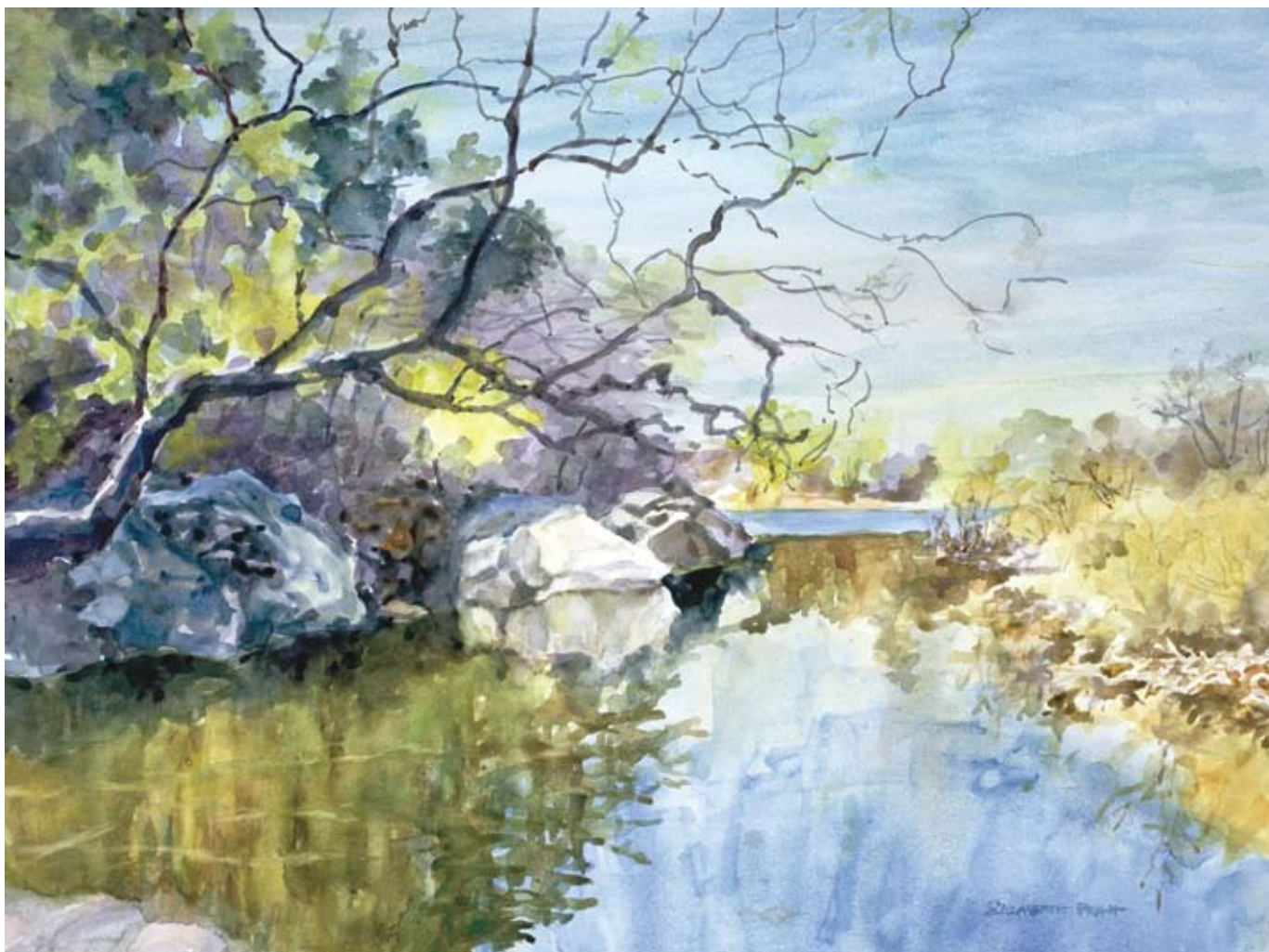
▲ THE MILL POND, WATERCOLOR, 19 X 26"

After working in watercolor for a majority of her career, Pratt has an intense understanding of the medium that allows her to experiment with different types of effects, including using crinkled paper, wax paper, plastic, tissue paper, salt and different kinds of inks.