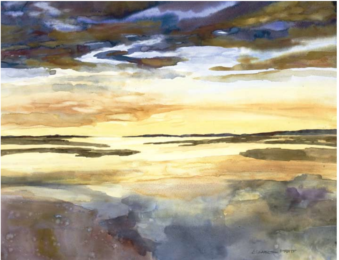
PURE GOLD, WATERCOLOR, 17 X 22"