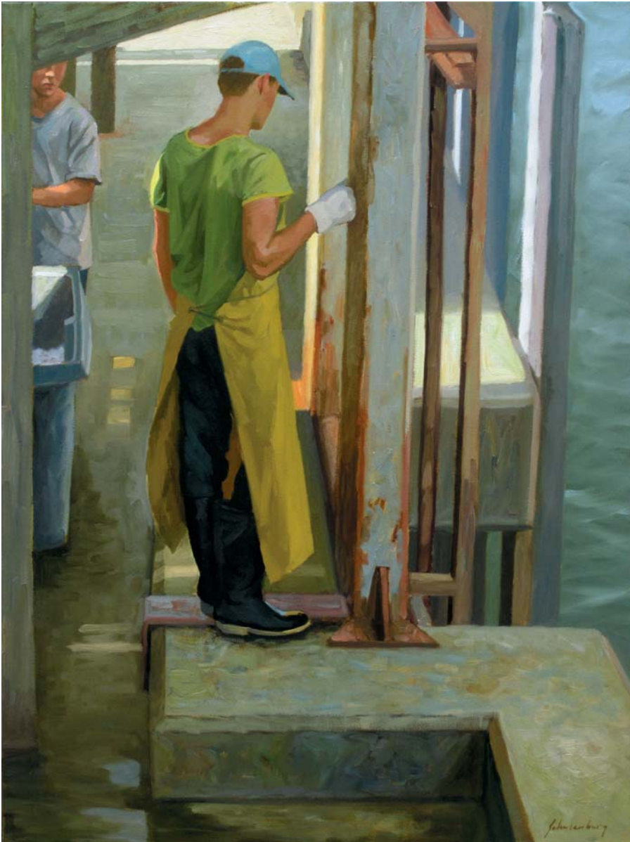
WORKING AT THE PIER, OIL ON CANVAS, 40 X 30"