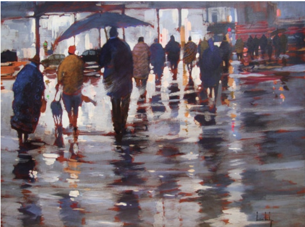
EVENING IN TOWN, ACRYLIC AND OIL, 38 X 51"