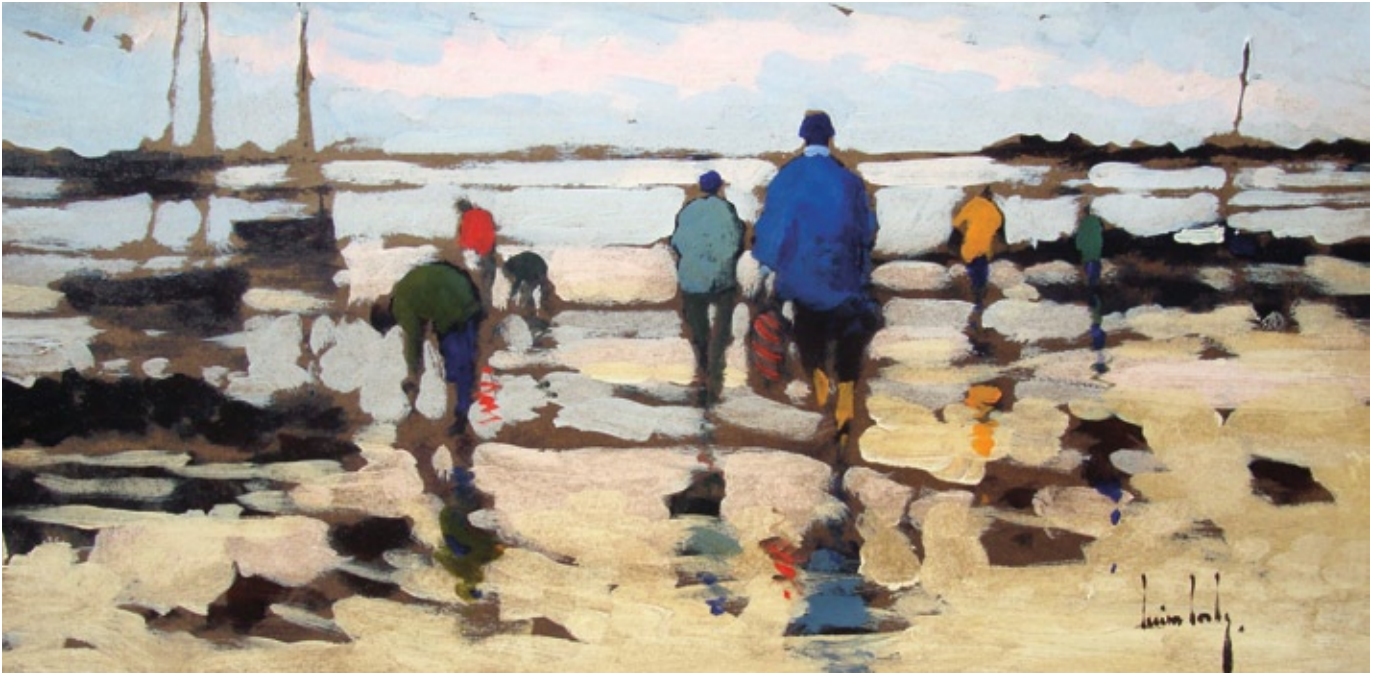
EVENING TIDE, ACRYLIC AND OIL, 11¾ X 23½"