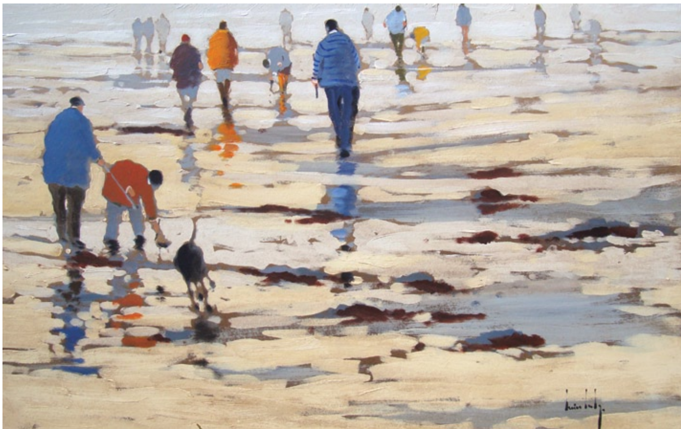
THE PUDDLES, ACRYLIC AND OIL, 28¾ x 45½"