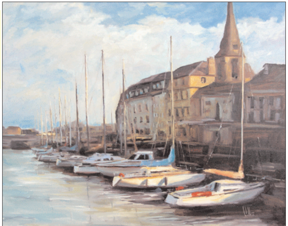
Morning in Honfleur oil Eric Emile Walker 24 x 30, framed 30 x 35.5 $2,600

paam.org capecodcreativearts.org artsfoundation.org cmfa.org capecodartassoc.org