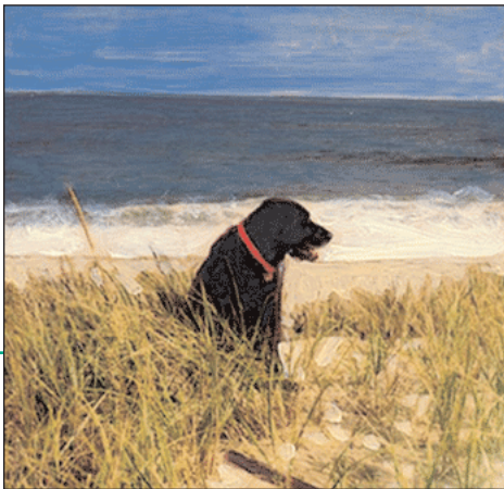
Dog in the Dunes

The Animal Rescue League is holding a silent auction at the Sheraton in Eastham on May 12 from 6 to 9pm. Stop by and help them help the lovable creatures that add so much to our lives.