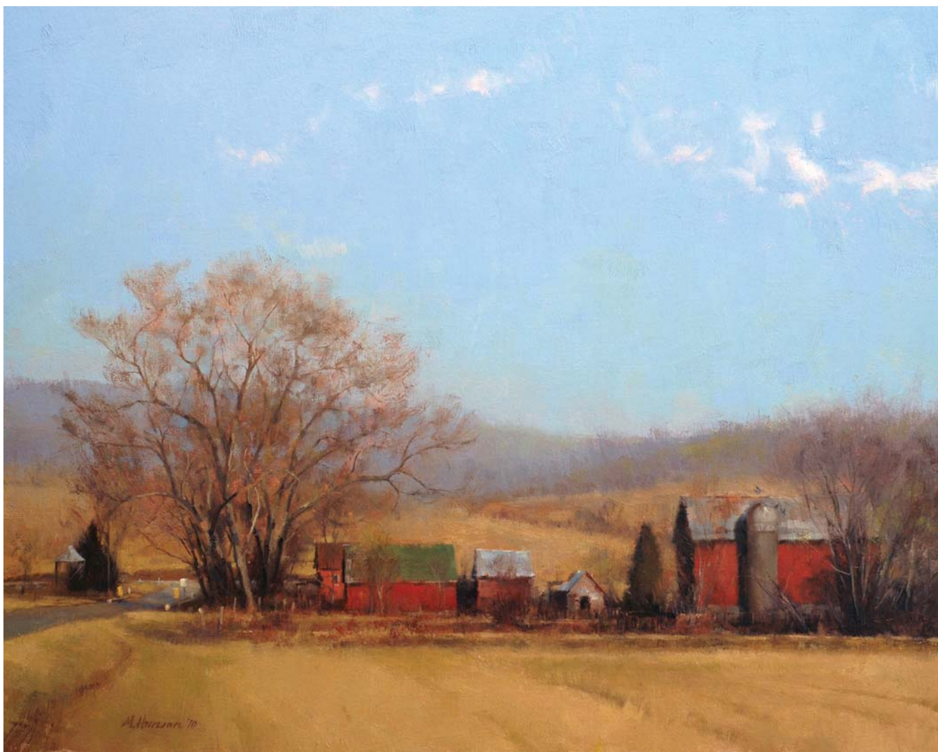
SPRING ARRIVES, OIL ON BOARD, 16 X 20"