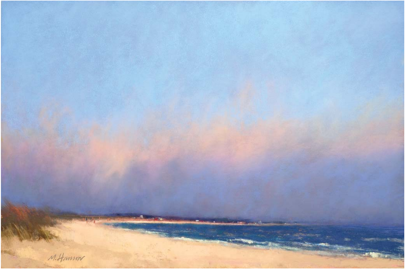
BEACH DAY, PASTEL, 8 x 16"