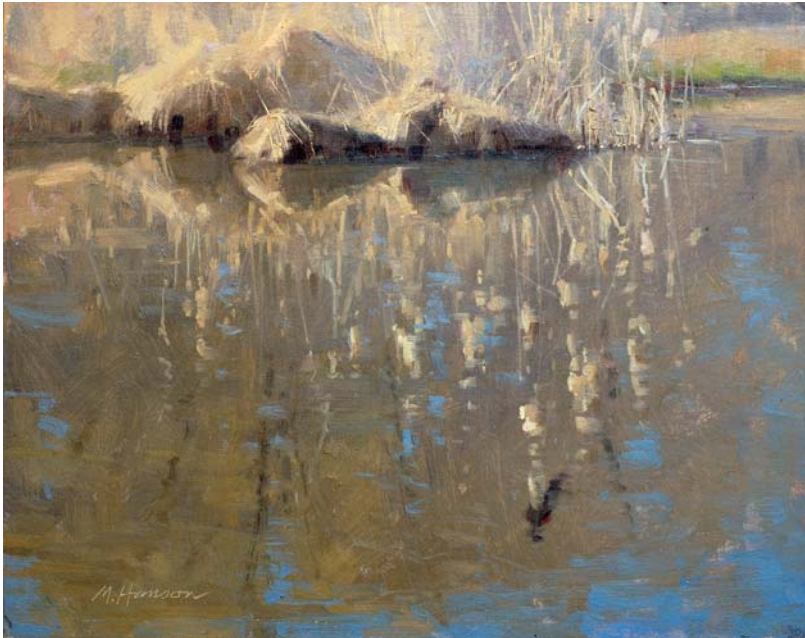
RED WING REFLECTIONS, OIL, 11 x 14"

particular, and my desire to communicate that deep seeded love is what drives my work," says Hanson. "My purpose is not to replicate the specific or dwell on the spectacular as much as it is to observe the specific and to discover the beauty in the seemingly unspectacular." ●