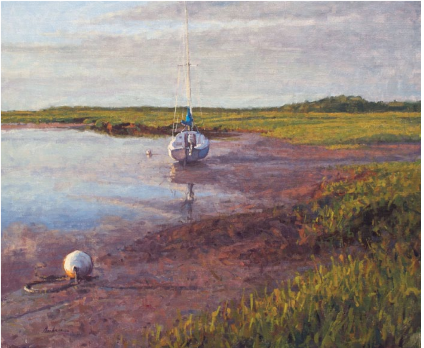
FRANK GARDNER, PEACEFUL EVENING, OIL, 20 X 24"