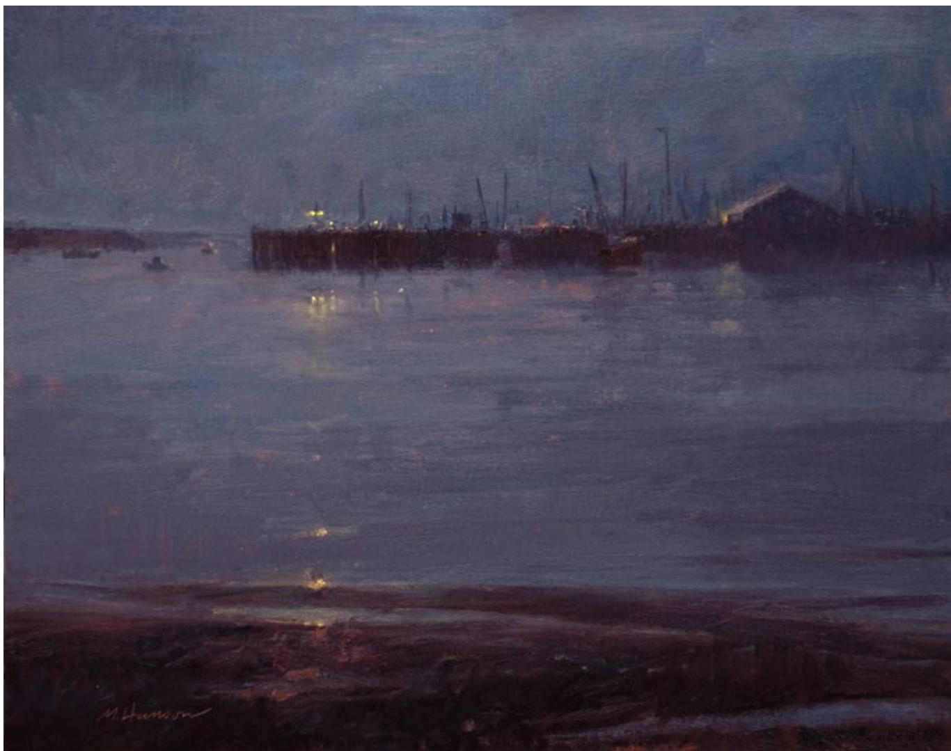
MARC HANSON, GRAY NIGHT, OIL, 16 X 20"

Recently, Hanson has found himself intrigued with nocturnal scenes around Cape Cod. "I've been out to the Cape on numerous occasions now and have always been intrigued with the area, Provincetown in particular, as