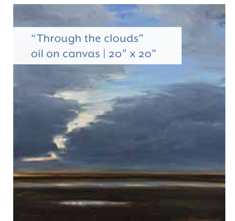
"Through the clouds" oil on canvas | 20" x 20"