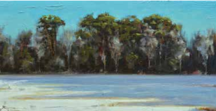
"Shadows over snowy field" oil on canvas | 12" x 24"