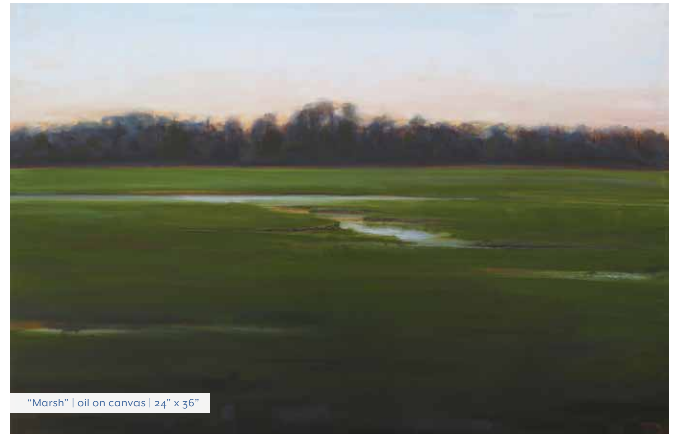
"Marsh" | oil on canvas | 24" x 36"