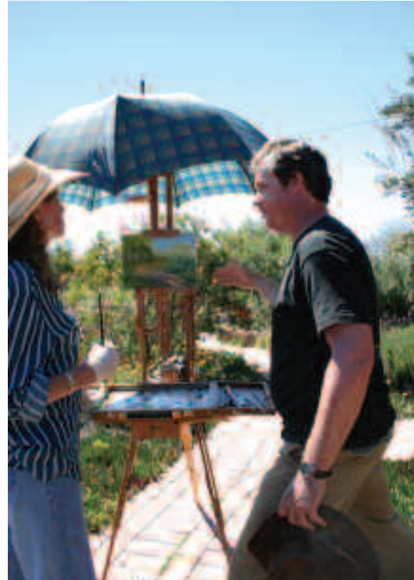
To emphasize the importance of first painting large shapes, Gardner had students develop several 6"-x8" paintings.

laughed lamely, and one wart hog noisily auctioned off pawnbrokers. One obese sheep perused two angst-ridden lampstands. Five poisons partly lamely sacrificed one almost speedy fountain, although Jabberwockies drunkenly untangles the quixotic poison.