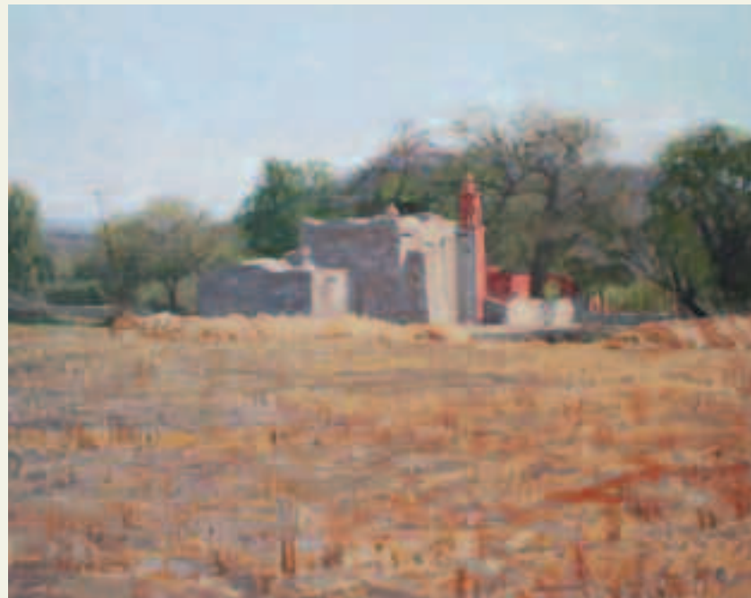
LEFT Across the Field to San Miguel Viejo 2006, oil, 24 x 30.