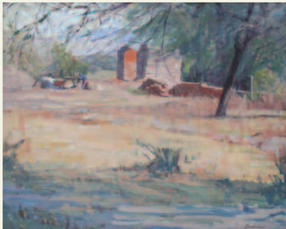
RIGHT The Brickmaker 2006, oil, 24 x 30.