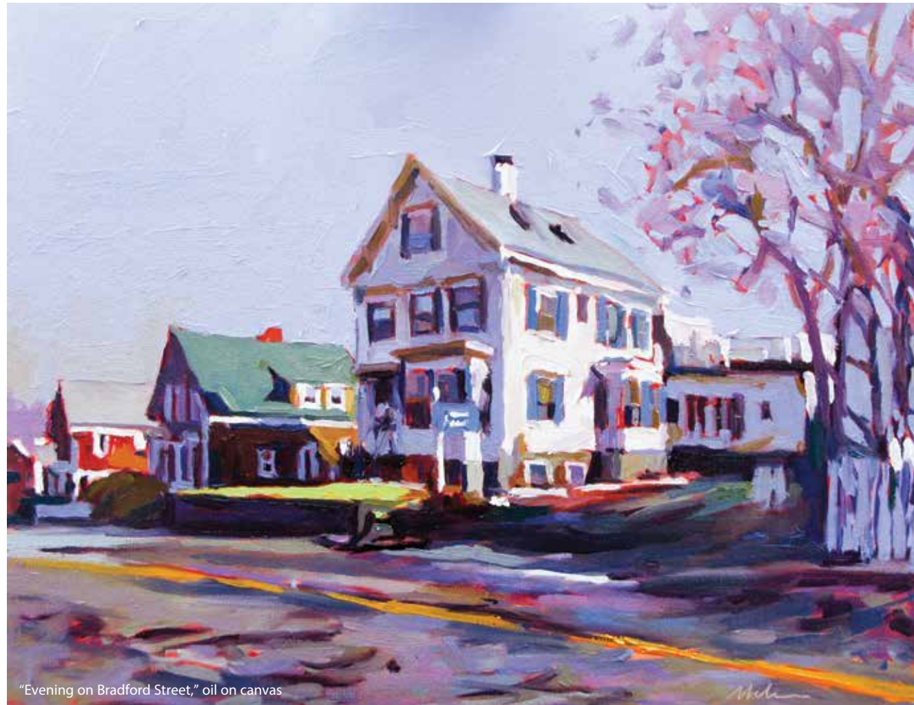
"Evening on Bradford Street," oil on canvas